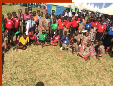
Jinja National Agricultural Exhibition June