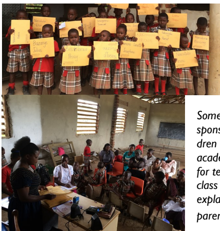
Some of our sponsored children with their academic reports for term 2. below class teacher explaining to parents.

Our sponsored children receive regular discipleship, pray with an adult and their families receive monitoring visits to ensure they are using the skills acquired to do gainful work.